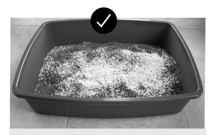
TIP: If having trouble getting your cat to use the Granules, mix them with litter, BUT ONLY in the litter box. Toss entire contents once the cat litter box is soiled.

Variation: Use only Washable Granules in their litter box until they have adapted to their use.