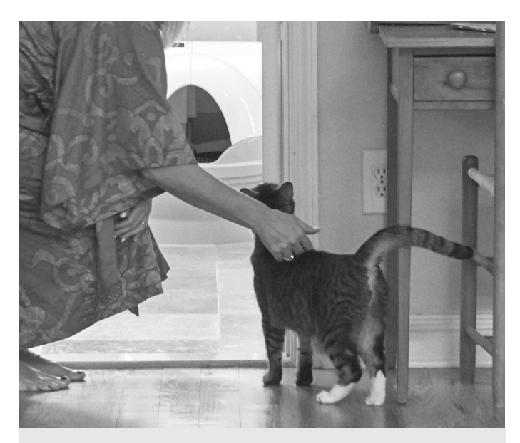
Allow your cats to investigate the CatGenie, giving treats and praise. Don't make a fuss over the Unit. Act normal.