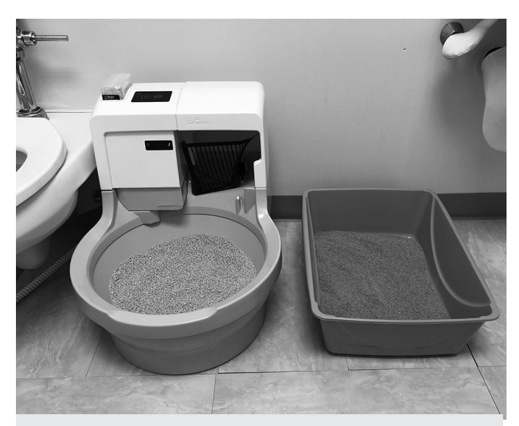
Keep old litter box and CatGenie together until cat switches, then remove and dispose of old litter box.